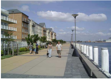
Walk along the Newcastle harbour foreshore

The first Australia District Annual Convention to be held in the beautiful harbour city of Newcastle is happening 24-27 August 2006.