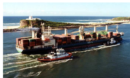
Vessel entering the harbour

Newcastle is the world's biggest coal port and we can promise you plenty of sights of the huge carriers entering and departing Newcastle harbour.