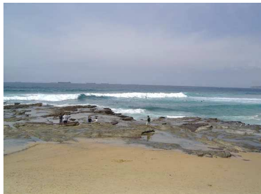
The views of Newcastle beach from Noah's on the Beach

The prices will go up as the time gets closer so make your decision now and fly into what will be a great convention. We promise to have a friendly local Kiwanian at the airport to meet any flight arriving the week of the convention.