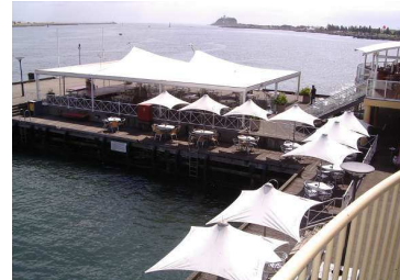
Dine at one of the foreshore restaurants

Many Kiwanians have already made the decision and booked their accommodation at the convention venue Noahs on the Beach. If you haven't made your decision to attend yet or are still tossing up which way to get to Newcastle it just became more attractive to do so!