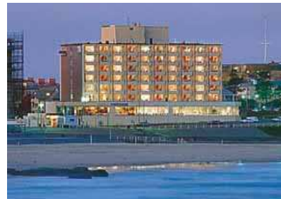
Our Convention Venue - Noahs on the Beach

The main convention venue Noahs on the Beach has a newly revamped dining and function area and is positioned in a stunning location overlooking Newcastle beach. The convention committee is striving for a "good value" convention with many of the events sponsored and costs kept to a minimum. All the registration details can be found on the Australian Kiwanis website or if you are not on the internet please contact Bryen Smith on 0412308251 and to obtain a hard copy Convention brochure including the Registration Form. For Bookings at Noah's On the Beach please quote the Booking Number 175459 .