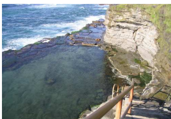
The convict built Bogey Hole

The main convention venue Noahs on the Beach has a newly revamped dining and function area and is positioned in a stunning location overlooking Newcastle beach. The convention committee is striving for a "good value" convention with many of the events sponsored and costs kept to a minimum. All the registration details can be found on the Australian Kiwanis website or if you are not on the internet please contact Bryen Smith on 0412308251 and to obtain a hard copy Convention brochure including the Registration Form. For Bookings at Noah's On the Beach please quote the Booking Number 175459 .