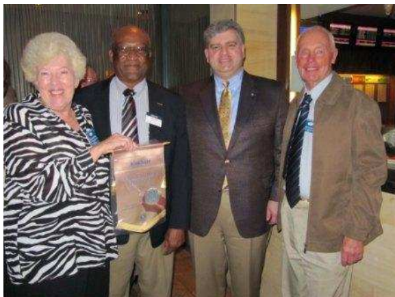
Kiwanis Sydney were excited to have the international president induct their newest member.