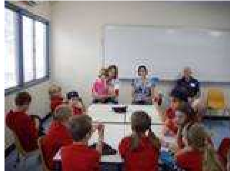
Ardtornish Primary students at the Meeting