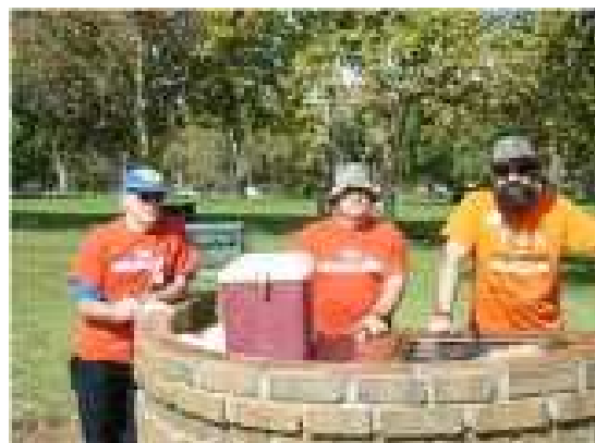
A team of Athelstone Kiwanians assisted at a check-point in the recent Amazing Race Around Adelaide for CanDo for Kids.