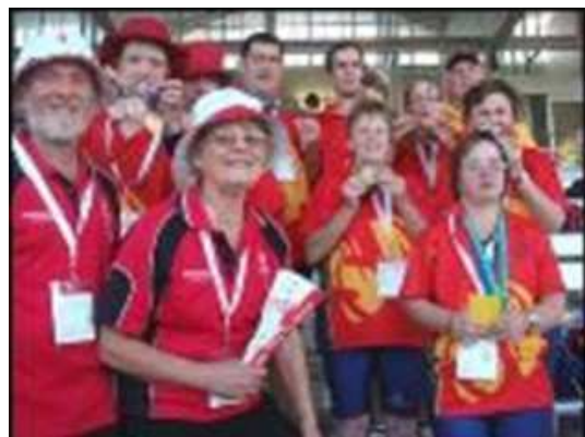
A few of the club members celebrate with a few of the winners