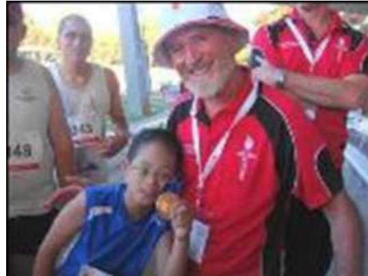
Volunteers with some of the athletes