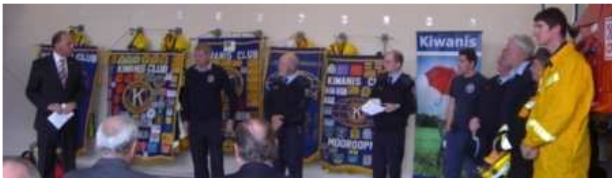
CFA equipment presentation