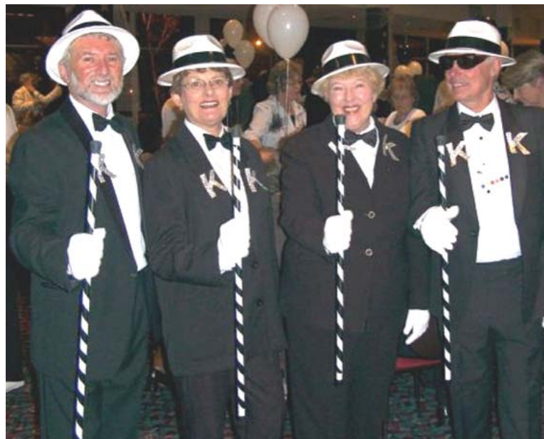
The Black and White troupe sing up a storm.