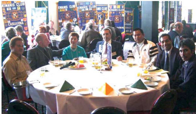
The team from East Timor at Convention.