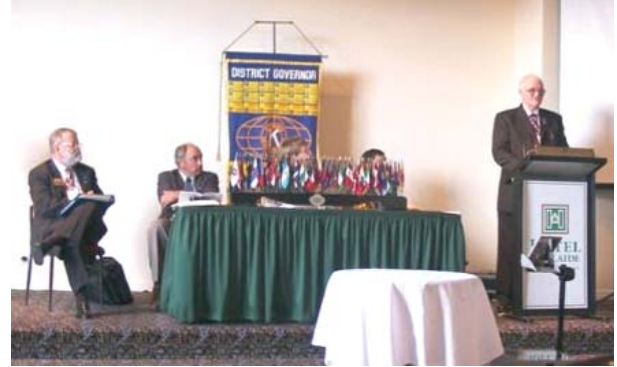
Adelaide Convention - Business Session