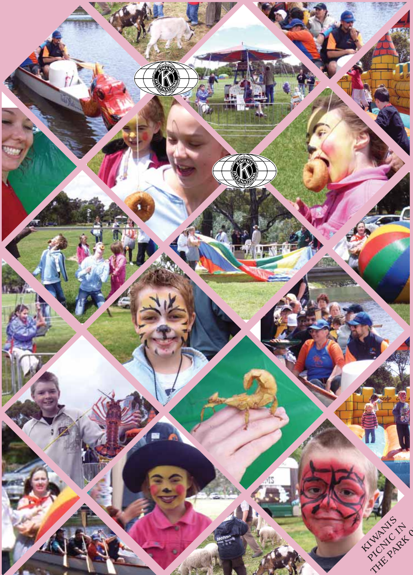
KIWANIS PICNIC IN THE PARK 05

NB: No responsibility is accepted for the accuracy of information contained in advertisements or text supplied by individuals or organisations, and/or typographical errors. Editor: David McNabb Phone: 0407 795 681 or email: dmcnabb@laneprint.com.au Items for inclusion in KAN can be emailed or posted. In electronic format, text typed in Word format is preferable. Pictures saved as JPEG or TIFF files are acceptable.