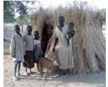
Below: A gift goat being distributed in Sudan.