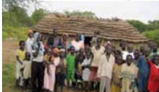
Waramoth Primary School's first classroom built in 2007

The name Timpir was chosen because many important events take place under trees in South Sudan including court hearings, wedding negotiations and traditional education. Also a newly shooting tree helps symbolise the new growth and development in South Sudan since the end of the 2005 civil war.