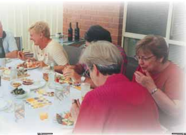
President's Luncheon at Krystyna's January 15, 2006