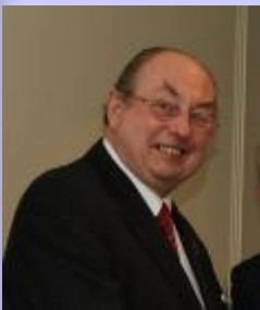
Our Secretary 2009-2010