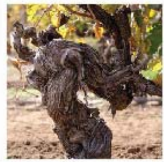
140 year old Shiraz Vine, Langmeil Winery, Tanunda