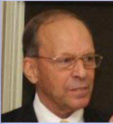
Our President 2009-2010